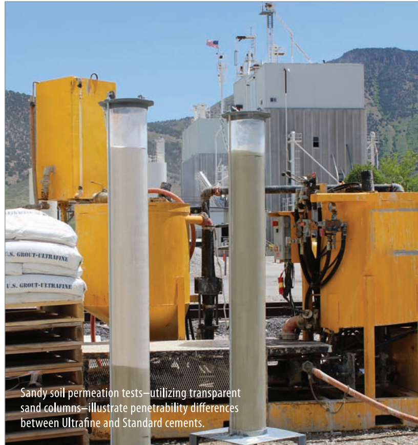
Sandy soil permeation tests—utilizing transparent sand columns—illustrate penetrability differences between Ultrafine and Standard cements.

100% American made and American sourced, Ultrafine and Microfine Cementitious Grouts are available in small bags, super sacks, and bulk pneumatics. Technical support is provided world-wide and available 24/7 by Avanti International.