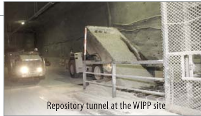
Repository tunnel at the WIPP site

Sandia National Laboratories developed this ultrafine cementitious grout specifically for the stress microfractures in the deep repository tunnel openings at the U.S. Department of Energy's Waste Isolation Pilot Plant (WIPP). Sandia then secured a patent and transferred the manufacturing process, under license, to U.S. Grout, LLC. US Grout produces the finely-ground mixture of